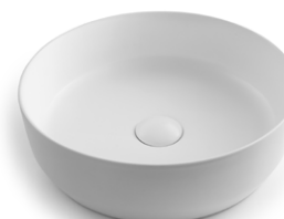
WHITE SILK MATTE